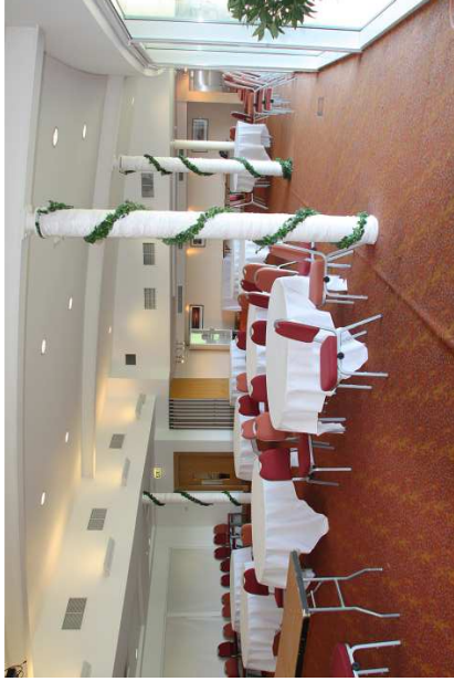
Pennine gallery hall, stage at far end.

This picture shows room set up for wedding. It will have stands, a stage and seating for the 'Guitar Factor' stage area.