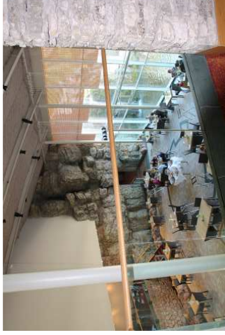
View down to Restaurant area