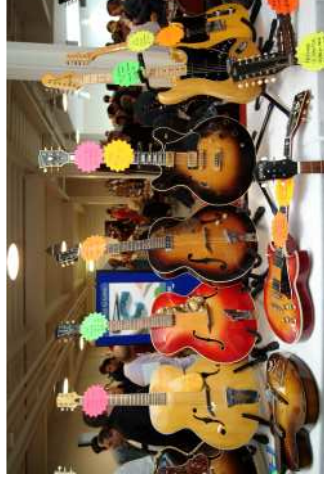
Part of a stand, non wall.