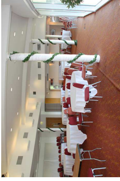
Pennine gallery hall, stage at far end.

This picture shows room set up for wedding. It will have stands, a stage and seating for the 'Guitar Factor' stage area.