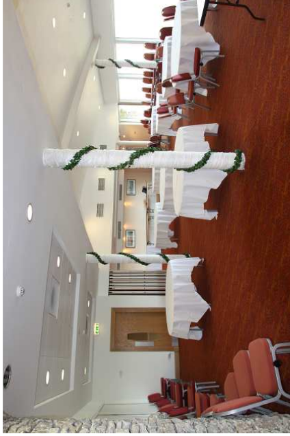
Pennine gallery hall stage at far end.

This is a very light and large room with great views out over the national park. As well as dealers we will have a small stage for performances from players who want to join 'Guitar Factor' and get voted best amateur player for the 2009 show. Voting will be carried out by visitors to the show filling in Ballot forms and posting them in a box.